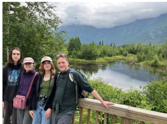
Chugach State Park near Anchorage, AK