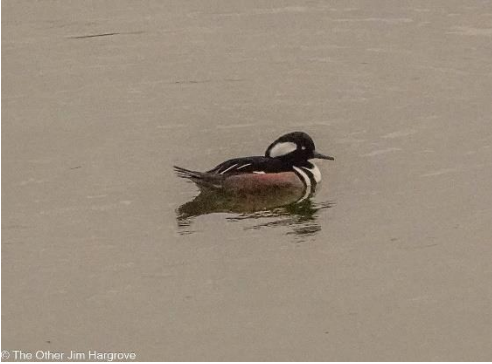
Male Hooded Merganser

One way we celebrate Christmas is by taking part in Christmas Bird Counts. This year, we repeated two we did last year: On December 17, we birded part of the Hayward Shoreline, which means Coyote Hills RP for us, one of our favorite birding locales. We hiked on a trail paralleling the water of the Bay. We saw lots of interesting species in the morning, then switched to some local city parks before heading home. One of the highlights of the day was this Hooded Merganser that we saw on a small pond.