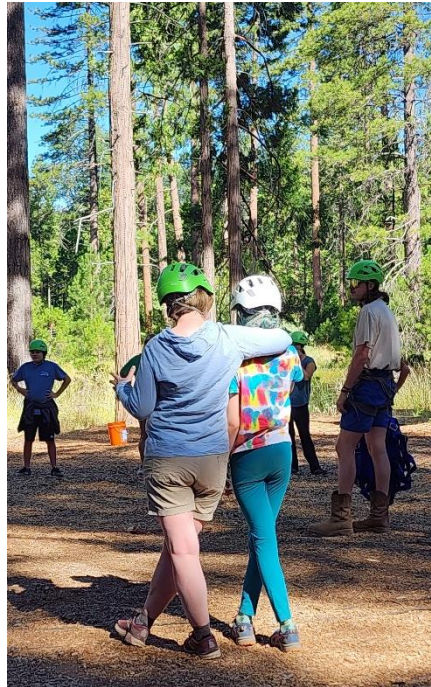
Ready to try Ropes Course