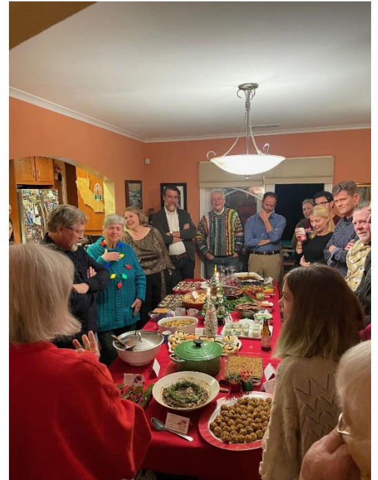
Iron Chef Dining Table