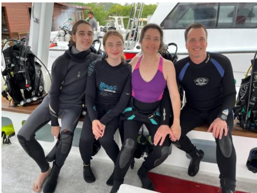
Scuba Divers in Roatan, Honduras