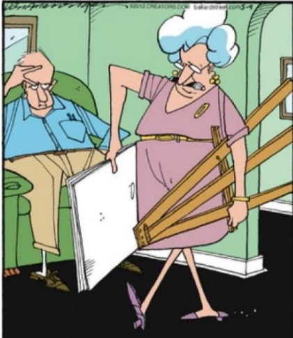
Linda's Critique of Jim's behavior may take longer than expected.

Here are our traditional cartoons stolen from the web, and a #Big Tree Photo from Brazil.