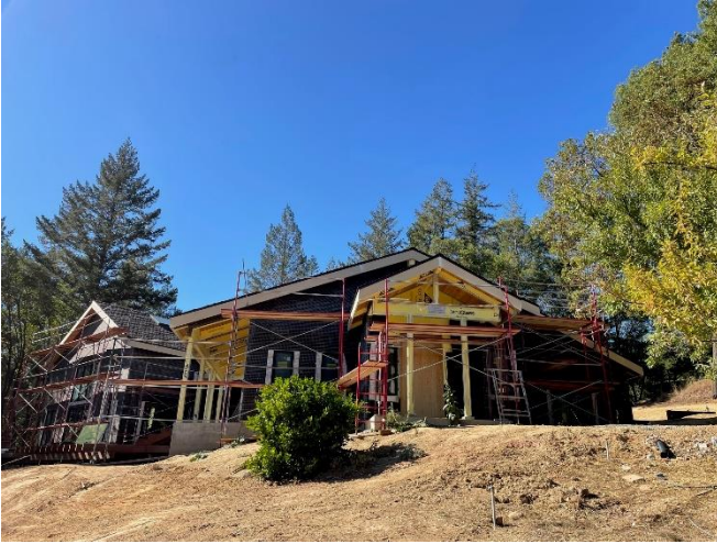
View of the ADU and stage/music/pool room. This view shows the main door to the ADU and scaffolding for the final stucco application.

The new structure in Philo is “almost complete.” We hope it will be finished for a late birthday and anniversary celebration sometime in the spring, after our trip to Texas. It’s still a work in progress as you can see in this photo.